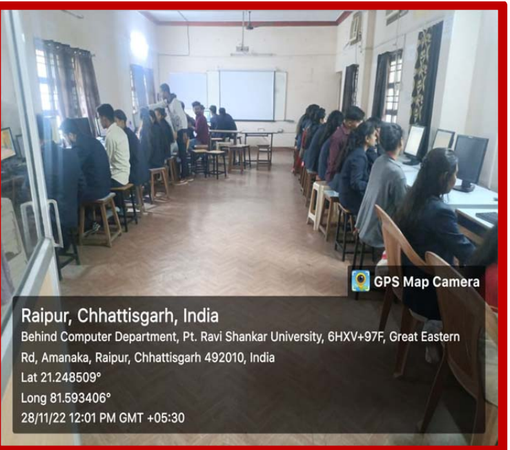
Raipur, Chhattisgarh, India Behind Computer Department, Pt. Ravi Shankar University, 6HXV+97F, Great Eastern Rd, Amanaka, Raipur, Chhattisgarh 492010, India Lat 21.248509° Long 81.593406° 28/11/22 12:01 PM GMT +05:30