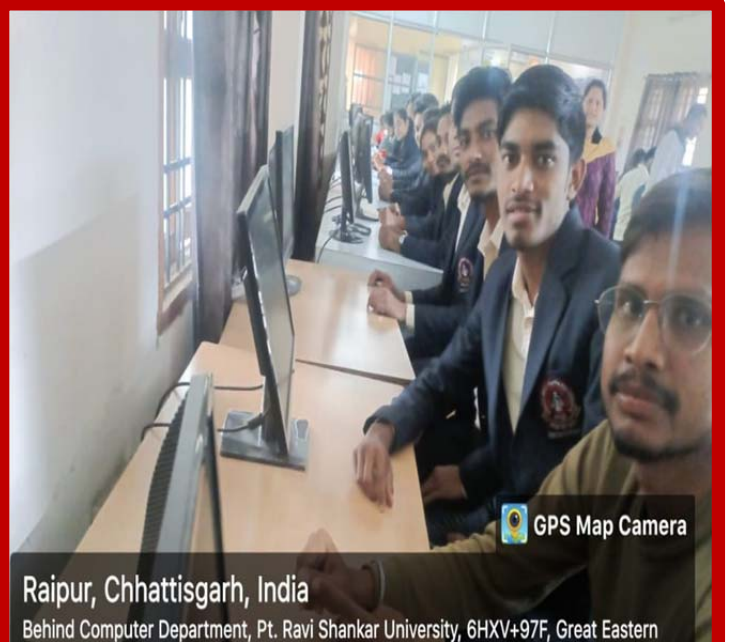
Raipur, Chhattisgarh, India Behind Computer Department, Pt. Ravi Shankar University, 6HXV+97F, Great Eastern