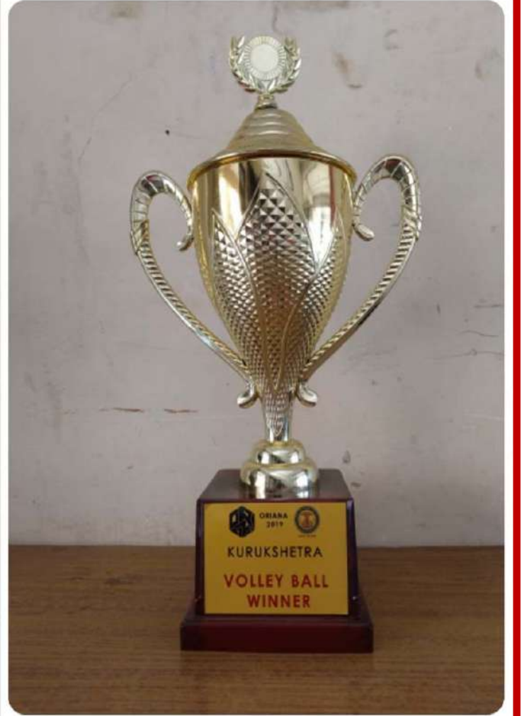
Oriana 2019 kurukshetra volley ball winner