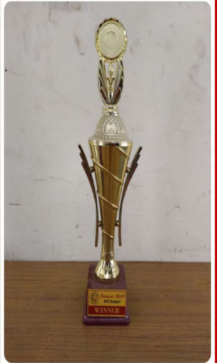
समर 2019 एनआईटी रायपुर विनर