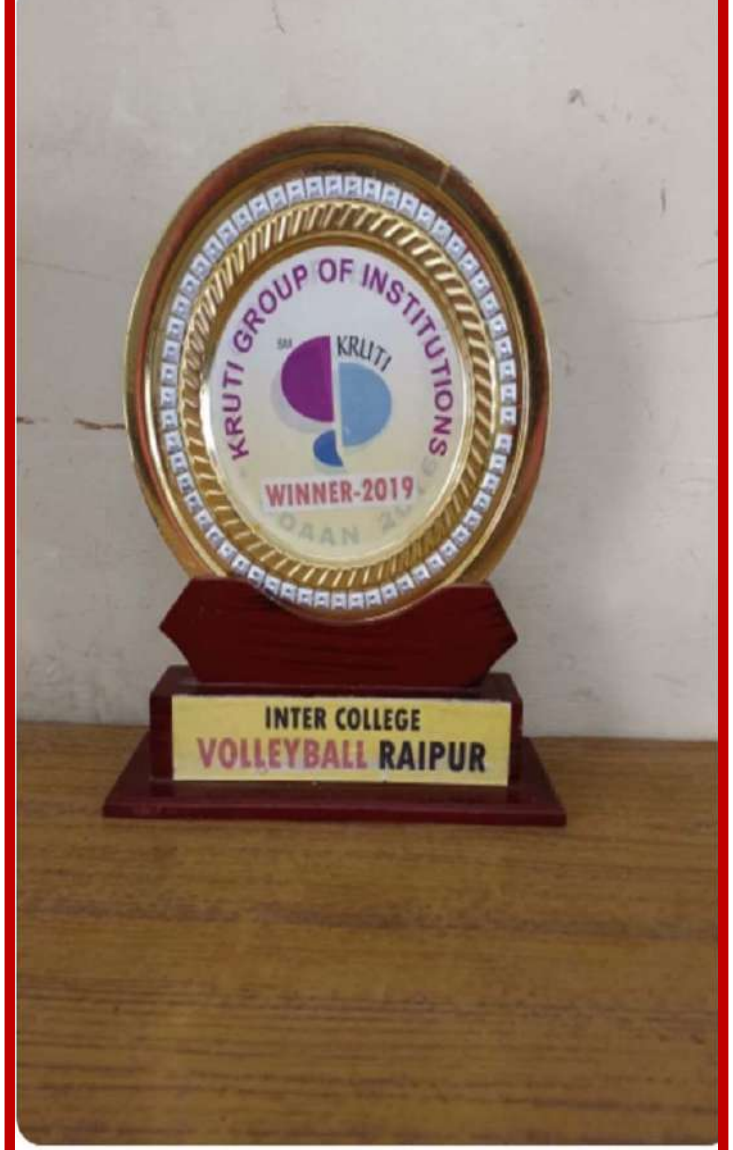
Inter college volleyball raipur 2019