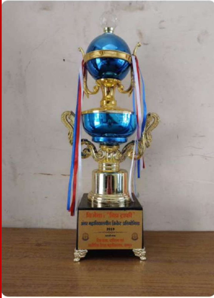
विजेता विप्र ट्रॉफी अंतर महाविद्यालय क्रिकेट प्रतियोगिता 2019 आयोजक विप्र कला वाणिज्य एवं शारीरिक शिक्षा महाविद्यालय रायपुर