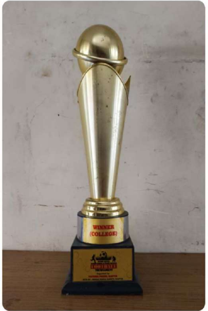
Winner college state level inter school and inter college tournament organized by patrika press raipur