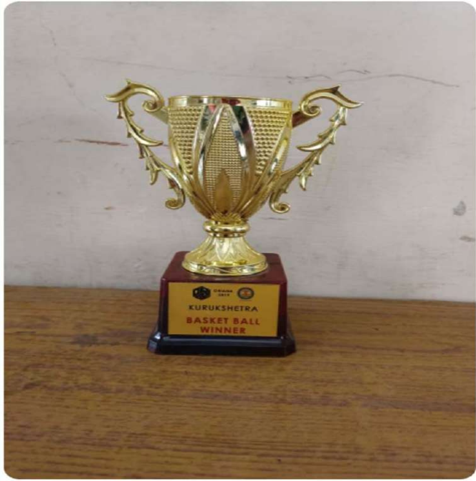
कुरुक्षेत्र बास्केटबॉल विनर 2019