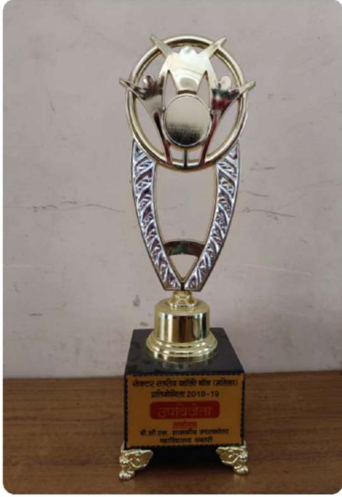
सेक्टर स्तरीय वॉलीबॉल महिला प्रतियोगिता 2018-19 उपविजेता आयोजक b. सी एस शासकीय स्नातकोत्तर महाविद्यालय धमतरी