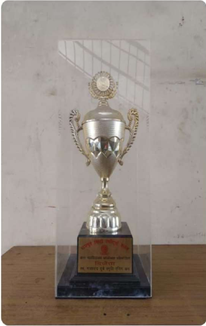
रायपुर सिटी स्पोर्ट्स क्लब अंतर महाविद्यालय वॉलीबॉल प्रतियोगिता विजेता