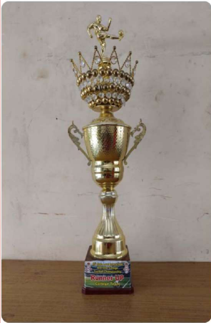
45th state level inter school and inter college runner up college team