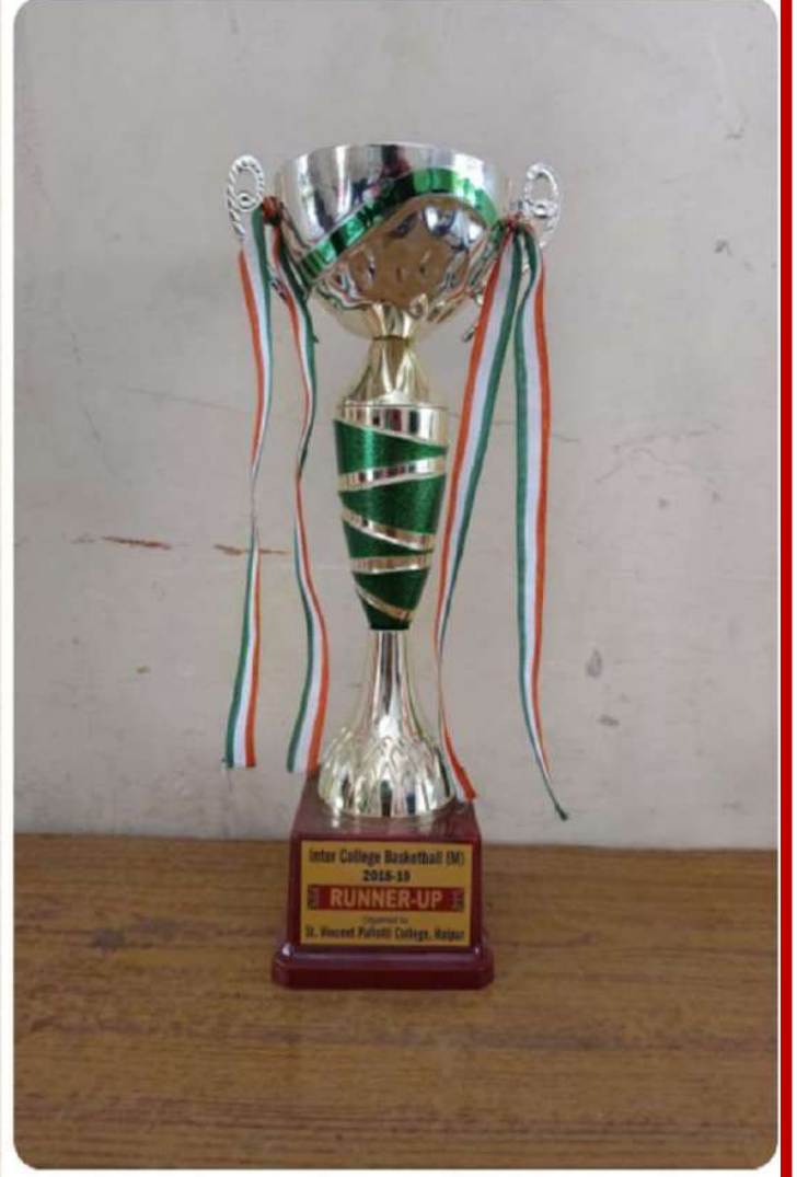
इंटर कॉलेज बास्केटबॉल महिला 2018 19 जनवरी organized by एसटीवी सेंड पॉली कॉलेज रायपुर