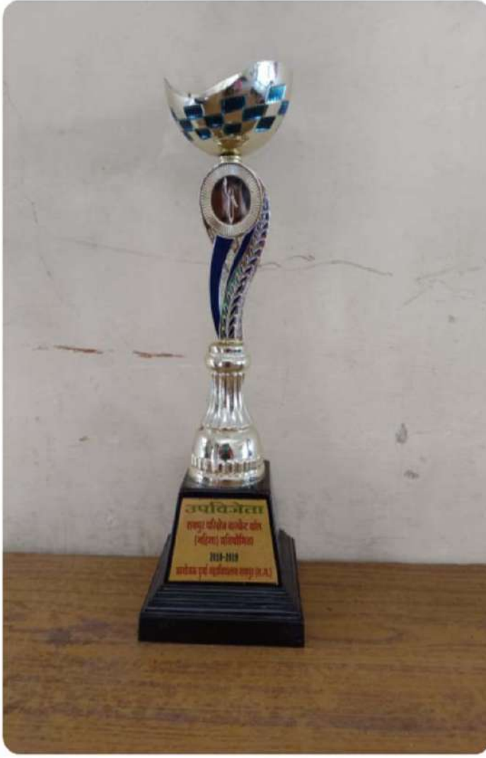
उपविजेता रायपुर परीक्षेत्र बास्केटबॉल महिला प्रतियोगिता 2018-19 आयोजक दुर्गा महाविद्यालय रायपुर छत्तीसगढ़