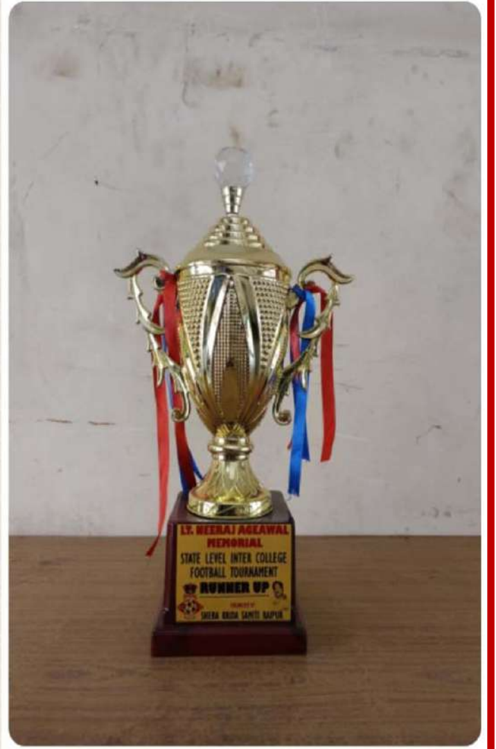
Let Neeraj agrawal memory state level inter college football tournament runner up organized by Shera krida samiti raipur