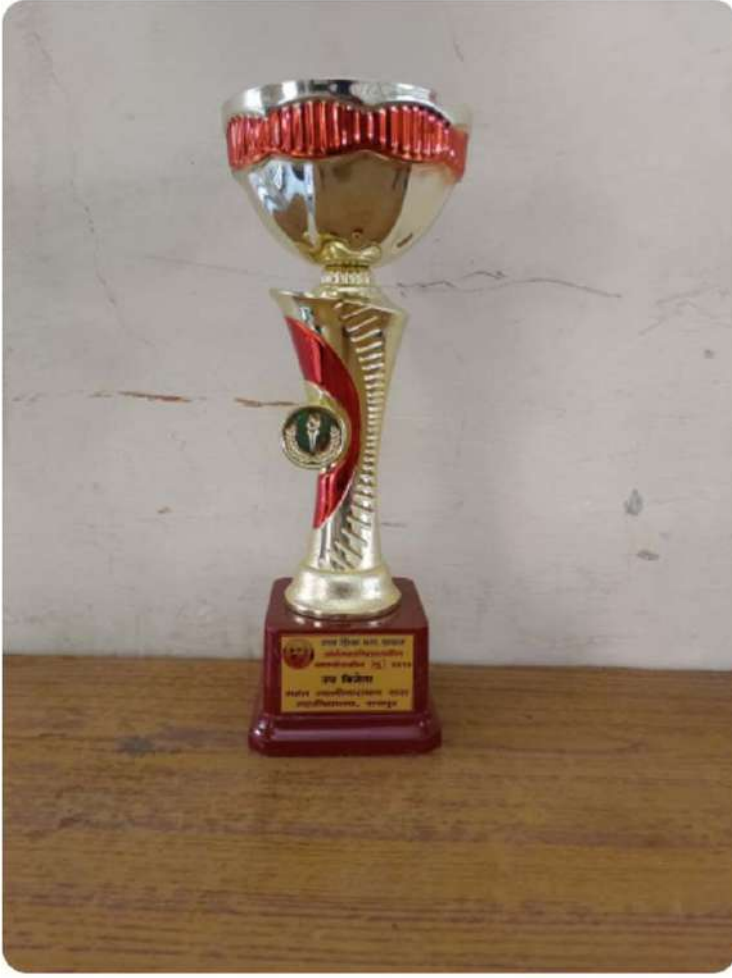
Uchch Shiksha Chhattisgarh shasan ant mahavidyalay basketball purush 2019 up Vijeta Mahalaxmi Narayan Das mahavidyalay Raipur